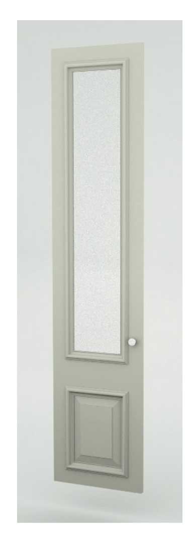
Georgian - Mirror