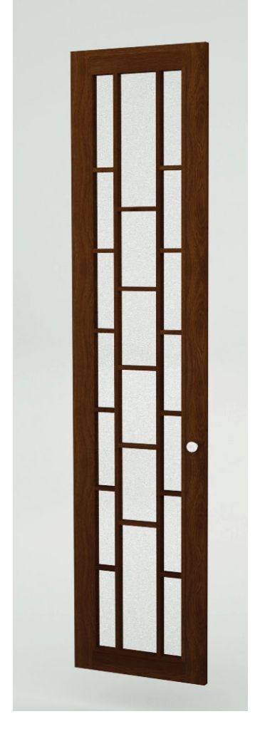
Deco -Brown Oak / Mirror