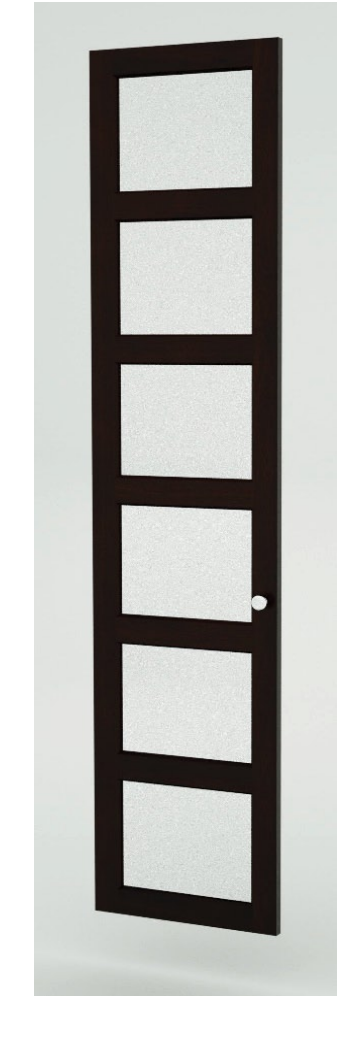
Metro -Burnt Oak / Mirror