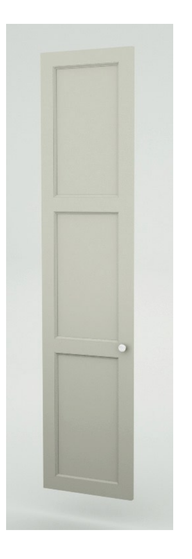
Victorian - Mirror