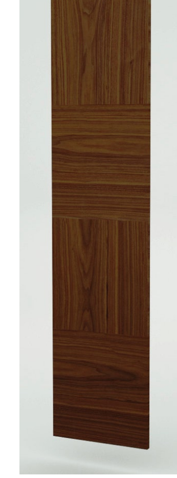
Retro - Walnut