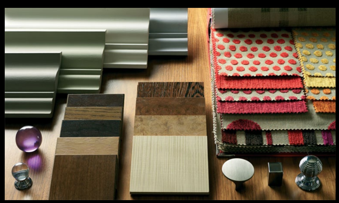
Bespoke choices and detail

www.englishwardrobecompany.com Tel: 01483 459 109 sales@englishwardrobecompany.com