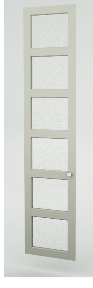
Metro - Mirror