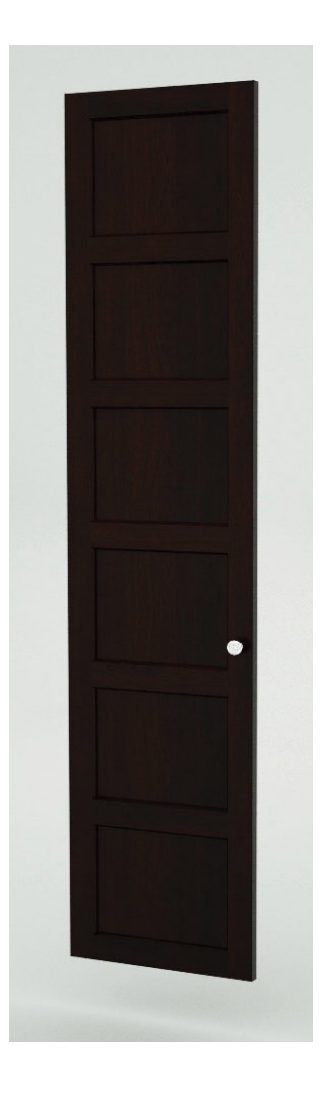
Metro -Burnt Oak