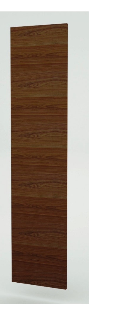
Modern - Walnut