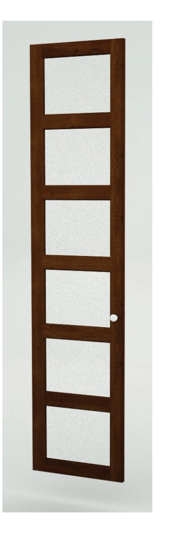
Metro -Brown Oak / Mirror