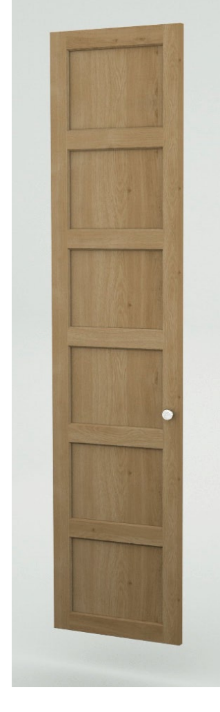
Metro -Natural Oak